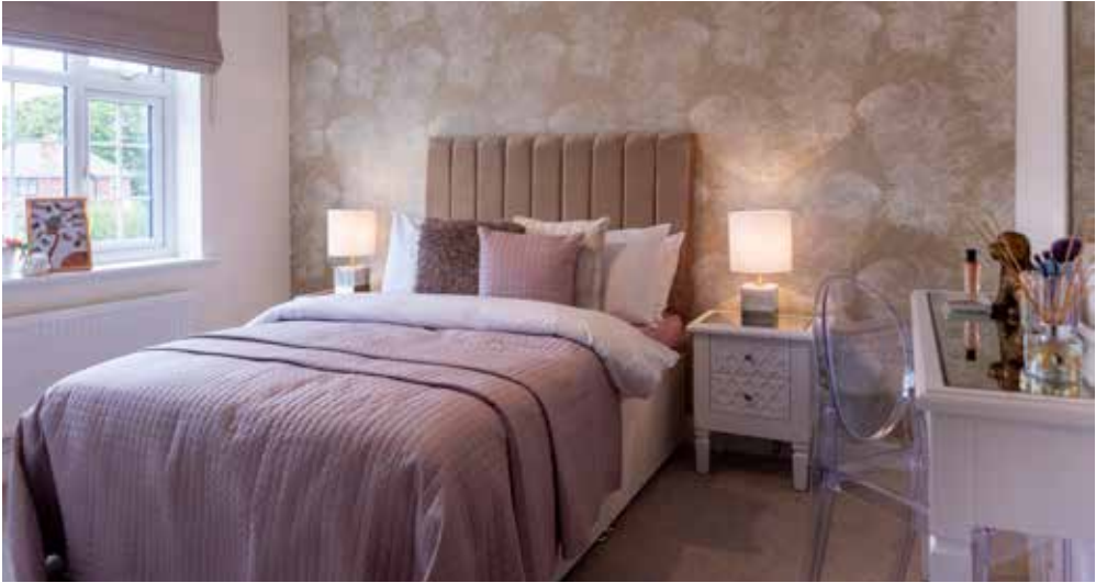
Images from Broadmeadow Park show home